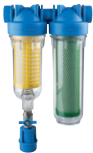
-RAINMASTER DUO- double stage RLH+CB EC