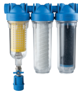
-RAINMASTER TRIO- triple stage RLH+FA+LA