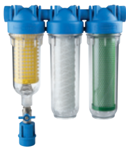
-RAINMASTER TRIO- triple stage RLH+FA+CB EC