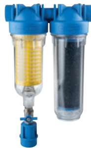
-RAINMASTER DUO- double stage RLH+LA