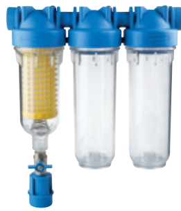
-TRIO RLH- triple stage