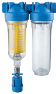
-DUO RLH- double stage